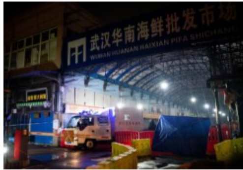
The Huanan Seafood Wholesale Market in Wuhan, Hubei Province.